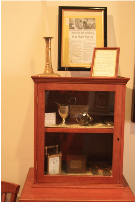
5: Cabinet containing jug and prism paperweight