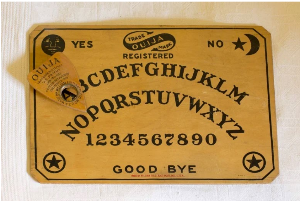
6: Ouja board