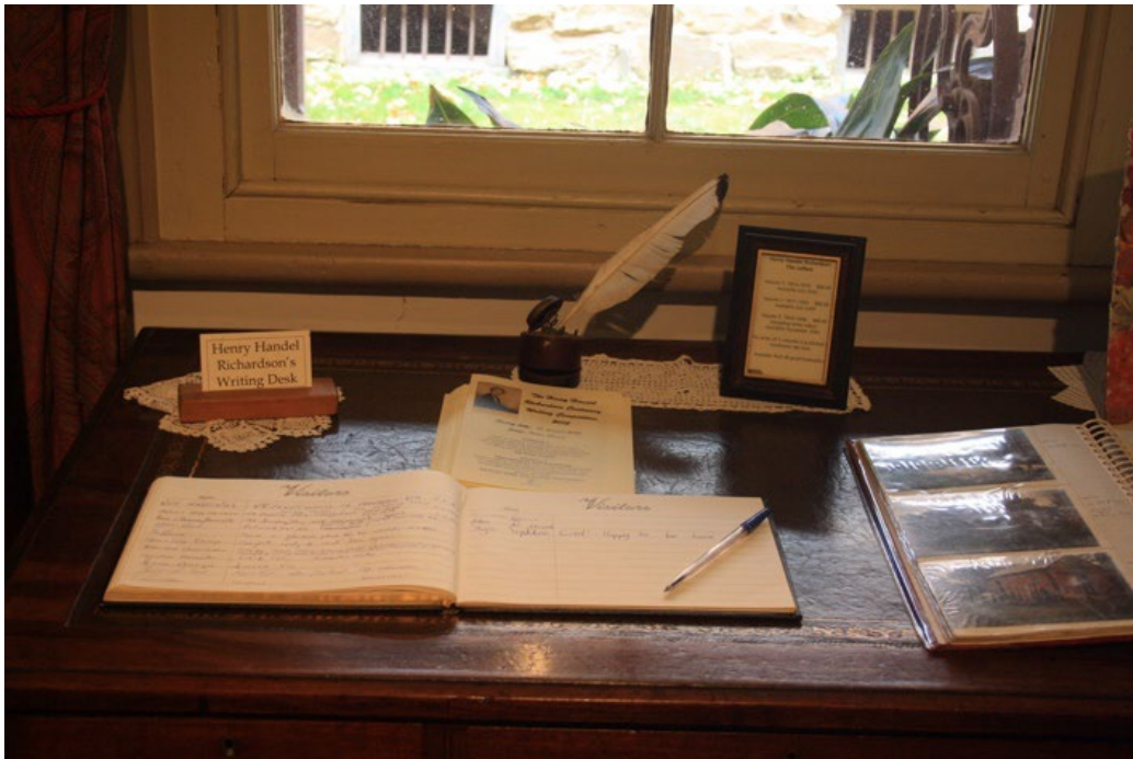
3: HHR's desk at Lake View