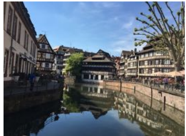
The Tanner's Quarters Strasbourg which feature in 'The Life and death of Peterle Luthy'