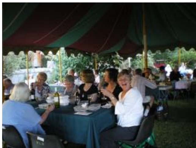
A happy group at a picnic tea

January 3, 2020 is HHR's 150 th birthday and the 50 th year that residents of Chiltern and other admirers of HHR and her work have gathered at Lake View to celebrate her birthday with a picnic tea. If you've never made it before, this is the year to come. Planning for celebrations is underway. More details in coming newsletters.