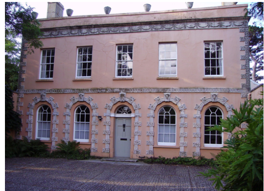
Belmont – John Fowles' house in Lyme Regis

Regis. Jane Austen visited the town on a holiday in 1804, HHR lived there from 1915-33 in a house called Westfield, and John Fowles lived there from 1965 until his death in 2005.